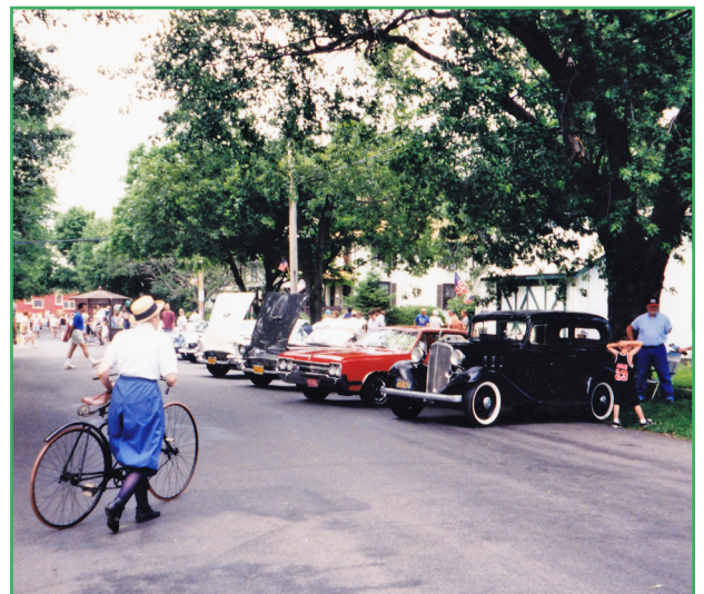
Classic & Antique cars on display during the Ivyland 125th celebration.

You can help us put together a 150th Anniversary literally for the history books. Let's get it started. Keep an eye out on the borough Facebook page and ivylandborough.com for updates.