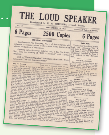
The Ivyland Heritage Association has preserved an archive of nearly all copies of The Loud Speaker.