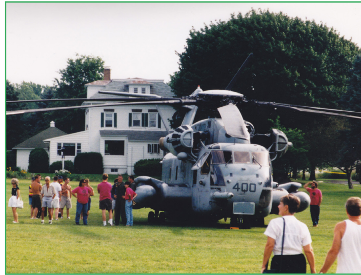
Scenes from the Ivyland 125 th Anniversary Celebration.